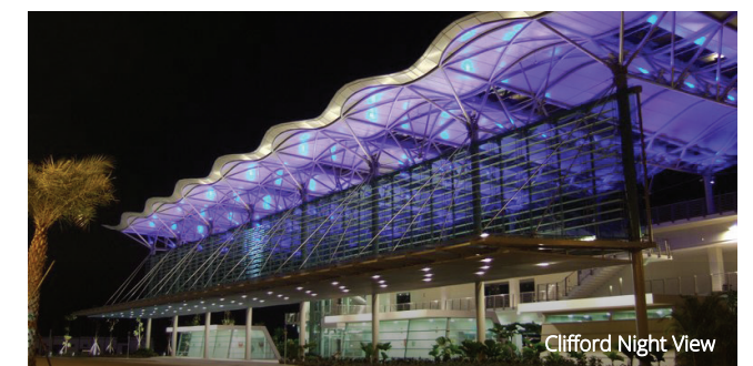
Clifford Night View