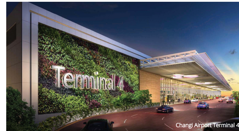
Changi Airport Terminal 4