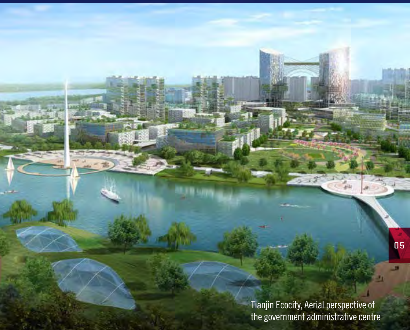
Tianjin Ecocity, Aerial perspective of the government administrative centre